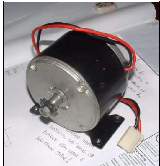
Motor – 250W Low cost Chinese built 250W electric scooter motor.

In our small vehicle projects we've generally found the use of DC permanent magnet motors to be least expensive and most satisfactory option – these are not the only type of DC motor that can be used but generally they are easy for the DIYer to get a hold of, are relatively efficient, physically compact and many can be used for reversing and dynamic braking applications. They also have the considerable advantage of being, at times, astonishingly inexpensive to buy – especially when Far Eastern built motors imported for electric scooter spares are considered. If you are keen on obtaining good levels of performance and controlled