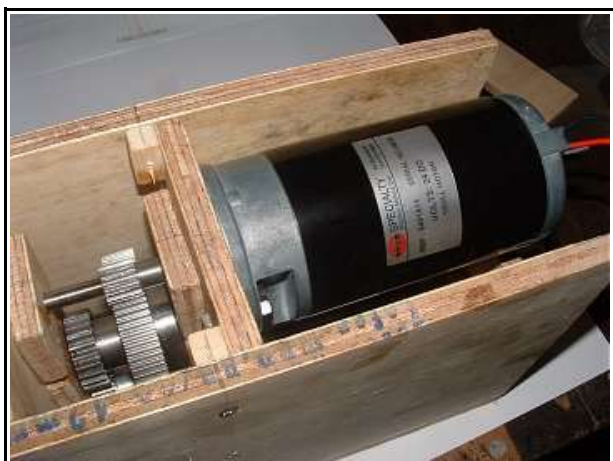
Motor – 250W – Wheelchair 250W wheelchair motor mounted in timber cased drive box – note the double stage gearing to reduce the drive speed to the main drive axle.

In most small EV applications, unless there is a very large speed range, the motors can be connected to their individual drive wheels through a fixed ratio transmission – by either gear, chain or belt. If you choose to use a single motor driving a single common axle with no differential clearly this transmission is to the axle, for drives with differential gearboxes the detail depends on the diff and its input and output provisions. For whichever arrangement an important mechanical design parameter is the reduction ratio ie the ratio of the motor shaft output speed to the road wheel speed – this must be built into the transmission. To get an initial estimate of this work out the rpm of the road wheel when the vehicle is traveling at its full powered speed (see Issue #12) and find out the rated shaft speed of the motor (the shaft speed at full rated load and voltage). Divide the shaft speed by the wheel speed and that's your required reduction ratio. If you do not build in enough of a reduction ratio the motor will try to drive the road wheel faster than intended and will experience shaft torque demand higher than its rated capability. For DC PM motors the current draw is roughly proportional to the shaft torque - high shaft torques lead to high currents and then to high rates of heat generation which in the end cause the motor to overheat.