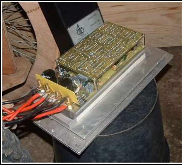
Controller – 150Amp 24/36V 150Amp controller with cover removed.

a properly rated controller cool than the motors it supplies!