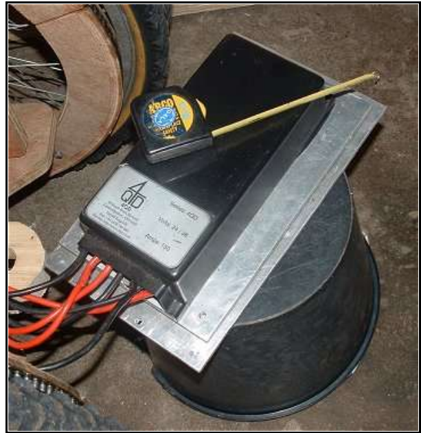
24/36V 150Amp Controller Note the aluminium heat sinking and the gauge of the power cabling.

motors as they slow a vehicle is fed back into the battery pack. In many ways electric drives perform much more like hydrostatic drives than clutch & gearbox mechanical transmissions. It is possible to make an electric vehicle work without a modern controller but using one provides many advantages in terms of performance, controllability and efficiency. The latter issue is important because the Achilles Heel of most EV's is the amount of energy that can be stored in a reasonably sized battery pack – losing a significant proportion of this through inefficient speed control circuitry is just plain daft.